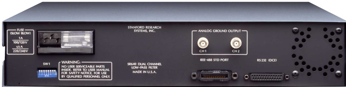
SR640 rear panel